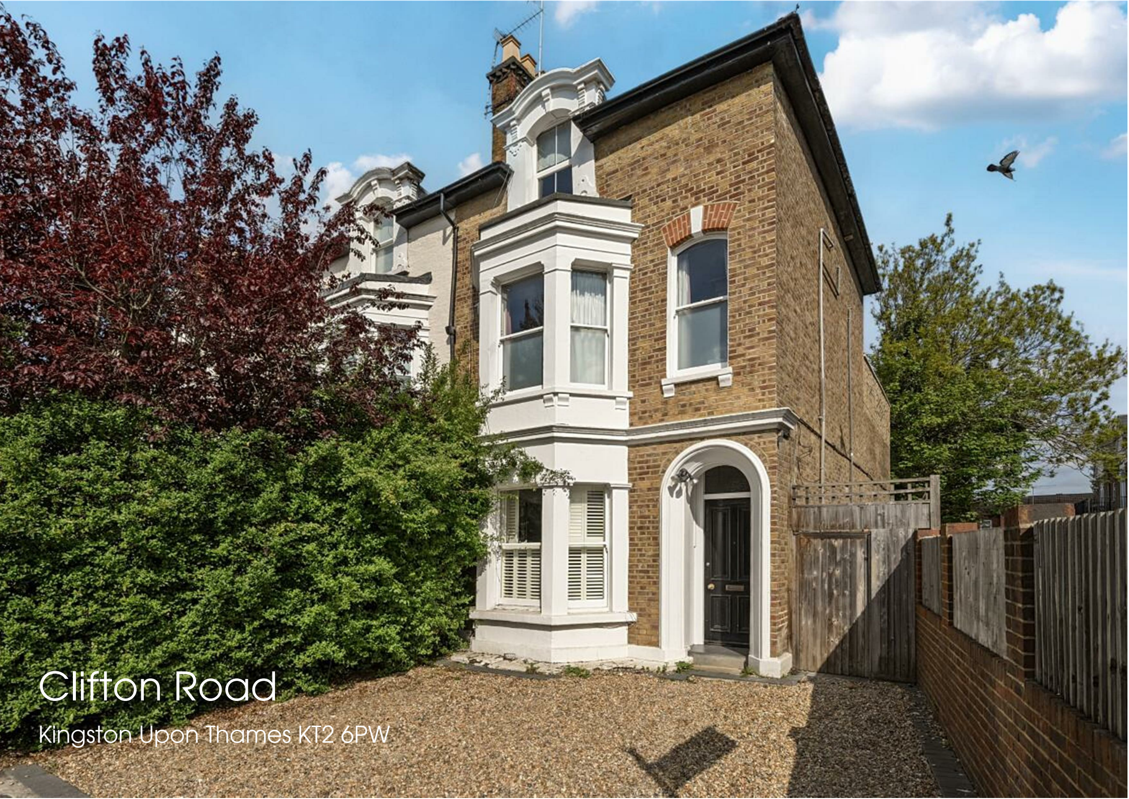
Clifton Road Kingston Upon Thames KT2 6PW